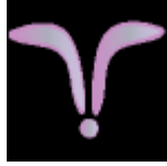
#43 Unseen Worlds