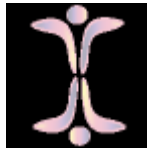
#48 God/Goddess/ All That Is