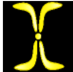
#44 Unspoken Worlds