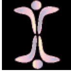
#48 God/Goddess/ All That Is