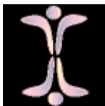
#48 God/Goddess/ All That Is