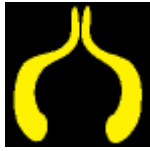
#5 Breath of Life