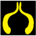
#5 Breath of Life

Ashwagandha is an herb from India that in ascension helps balance the reproductive hormones and align them with the regeneration hormones of the crystalline biology. Reproductive hormones flow with the moon cycles and cause the biological cycles of ascension to align each month in any calendar year to assure that all parts of the body are regenerated and ascended. There are cycles of ascension and if one moves out of the cycle, certain organs glands or systems may be skipped over and lag behind the rest in the vibration of the form leading to disease over time. Ashwagandha will aid in identifying what organs glands or systems are lagging behind in one's ascension so that they can be brought into a more current genetic blueprint and hold a common vibration with all of the biology..